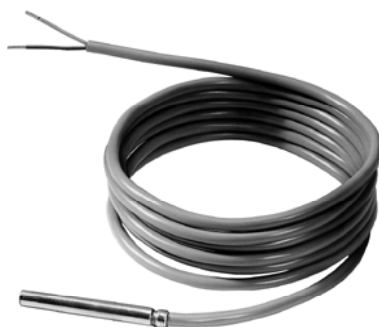
QAZ21... and QAZ36...